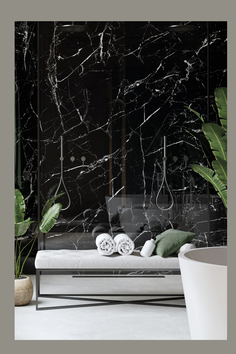
/ Marmo Morocco